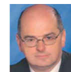
Rt. Hon. The Lord Mayor of Belfast, Cllr. Pat Convery, MLA

Robin was appointed Junior Minister in the Office of the First Minister and deputy First Minister on 1 July 2009. He has a wealth of political experience, being first elected to the Northern Ireland Assembly in November 2003 and re-elected in March 2007. He has been a member of Belfast City Council since 1985 and was elected High Sheriff of Belfast in 1999.